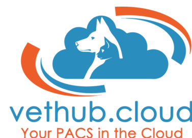
IMAGE ARCHIVING SOLUTIONS